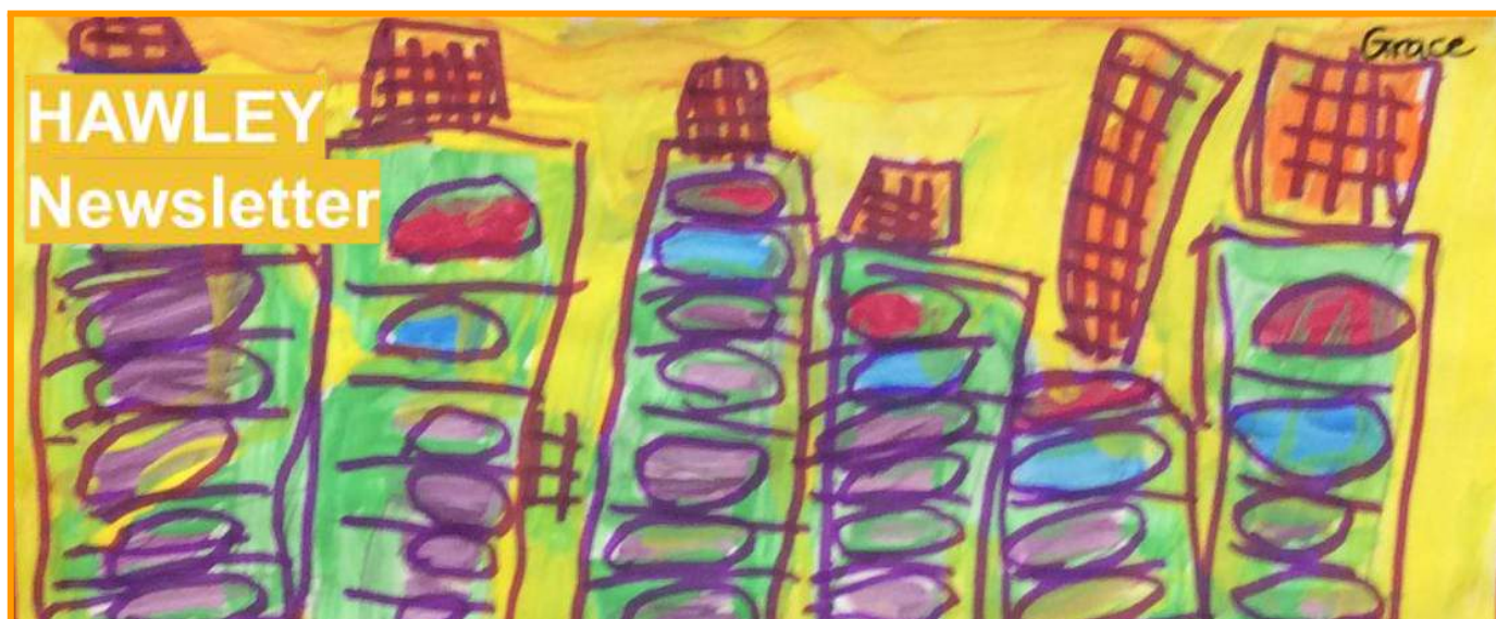
Year 1 artwork inspired by Friedensreich Hundertwasser