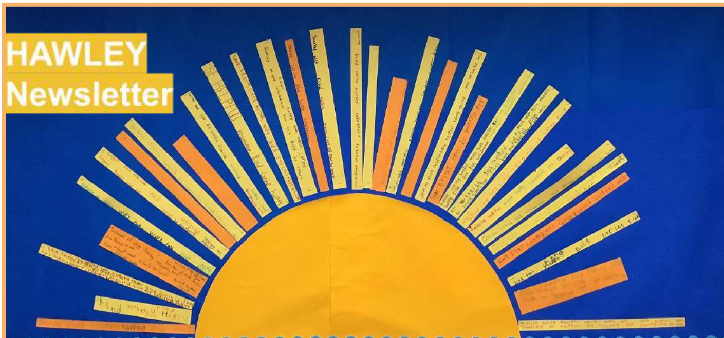
Year 2's Sunbeams