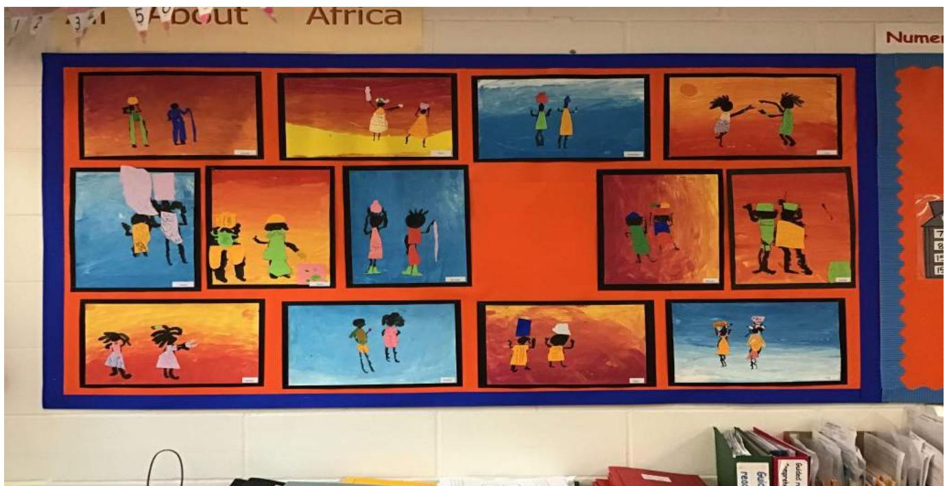
Artwork by Year 2